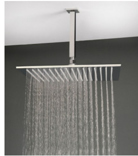
Mains pressure only